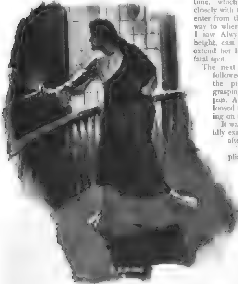
There was a click, followed by a spark, as the flint of the pistol ... struck against the rusty pan.

Clad in this garment she reached the balu-